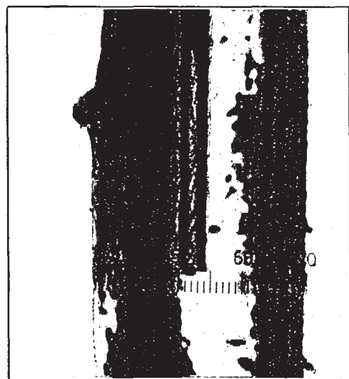
Fig. 1. PHOTOMICROGRAPH OF ELECTRODE INSIDE GIANT AXON. 1 SCALE DIVISION = 33 \mu .

The following method was used. A 500 \mu axon was partially dissected from the first stellar nerve and cut half through with sharp scissors. A fine cannula was pushed through the cut and tied into the axon with a thread of silk. The cannula was mounted with the axon hanging from it in sea water. The upper part of the axon was illuminated from behind and could be observed from the front and side by means of a system of mirrors and a microscope ; the lower part was insulated by oil and could be stimulated electrically. Action potentials were recorded by connecting one amplifier lead to the sea water outside the axon and the other to a micro-electrode which